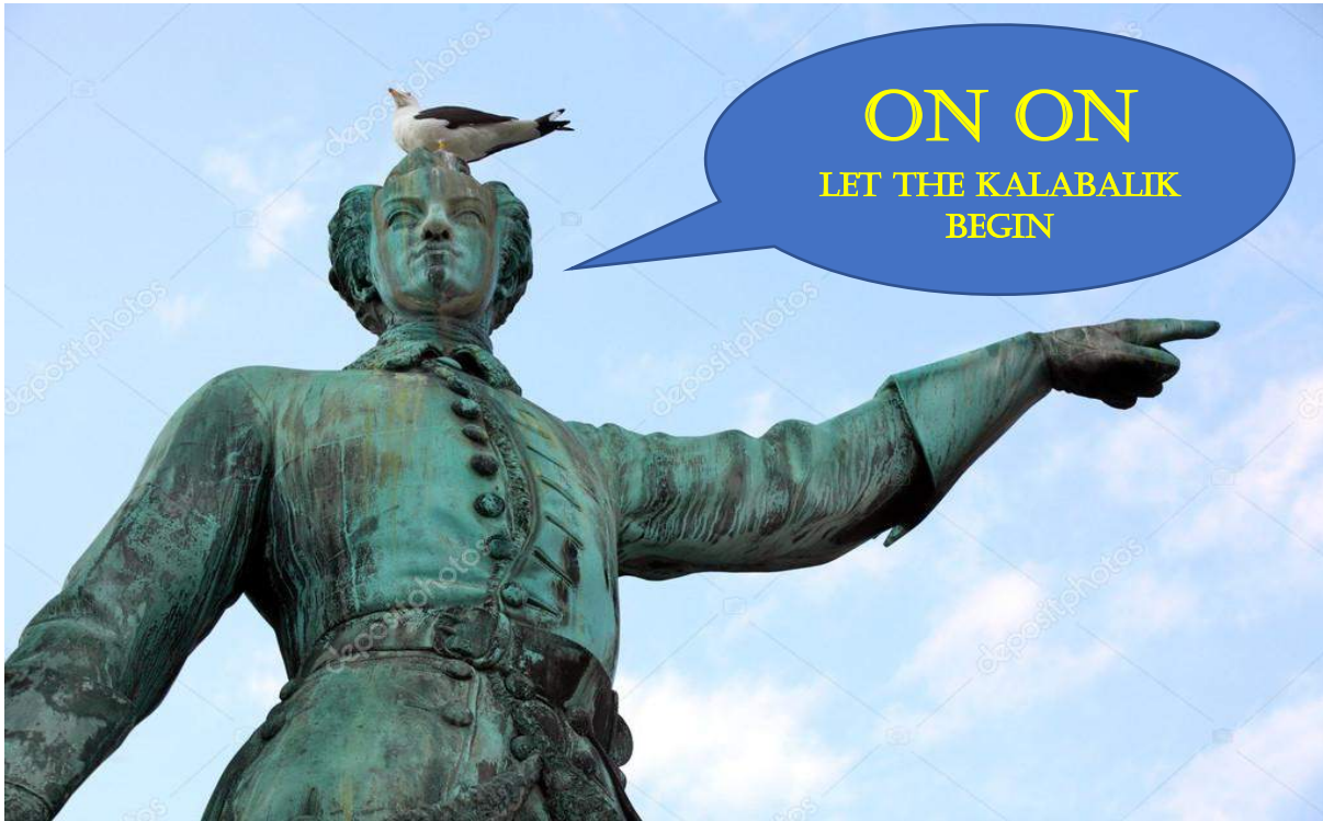
Carolus XII pointing the hashers the way to Bender